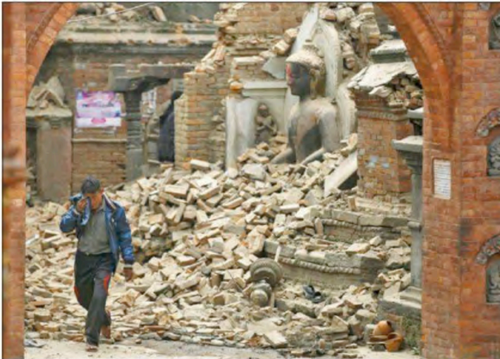
A man breaks down as he walks past a Buddha statue in a wrecked temple in Bhaktapur

Apart from 19th century Dharahara tower, 80% of temples in Basantapur Durbar Square destroyed . These include Panchtale temple, the 9-storey Basantapur Durbar, the Dasavatar temple & Krishnamandir. Kasthamandap , the 16th century wooden temple that inspired the name Kathmandu also flattened